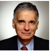
Ralph Nader, Consumer Advocate, Lawyer (Founder)